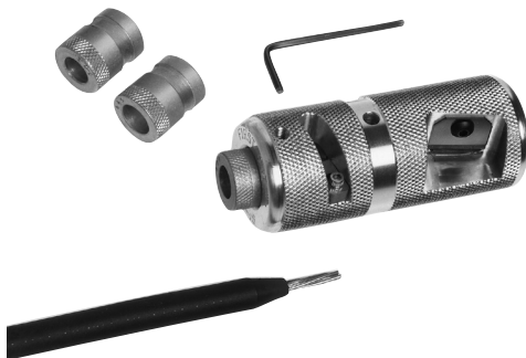
10036-36 Cable Penciller