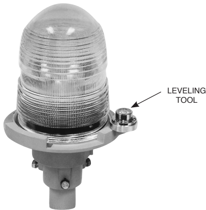
50029 Leveling Tool-ERL